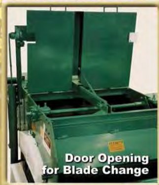
Door Opening for Blade Change